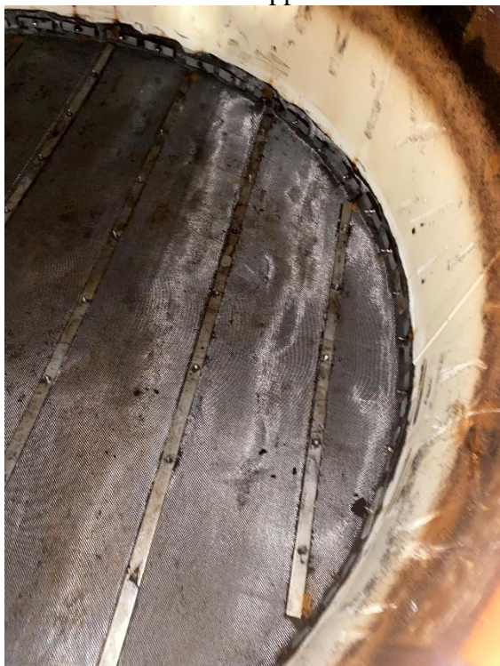
Filter 2 – screen and supports