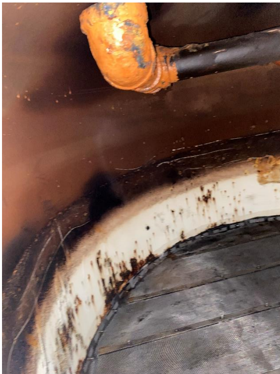
Filter 3 - internal distribution piping.