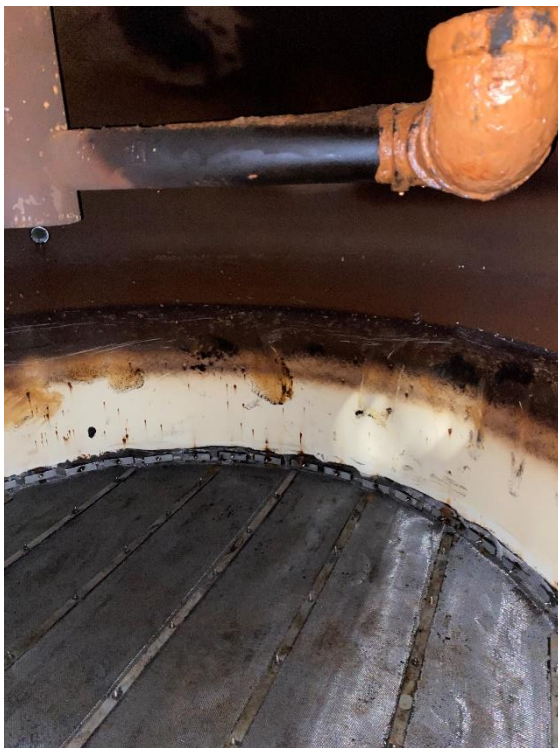
Filter 2 - internal distribution piping.