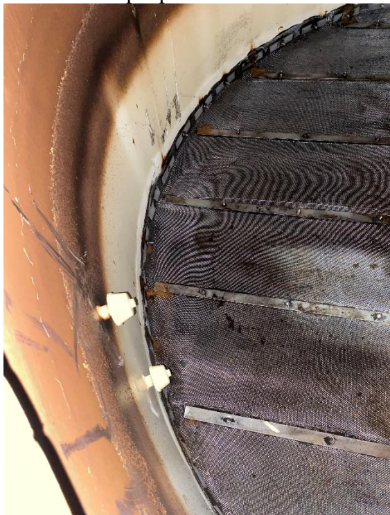
Filter 3 – sample ports - old