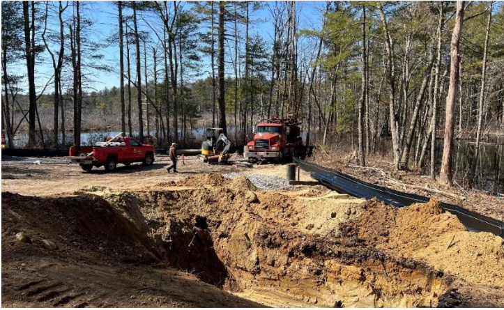
Photo – wellfield site – developing wells and filter pack glass beads.