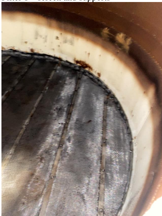
Filter 1 – screen and supports