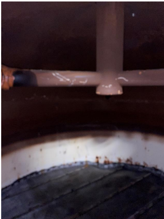
Filter 1 - internal distribution piping.