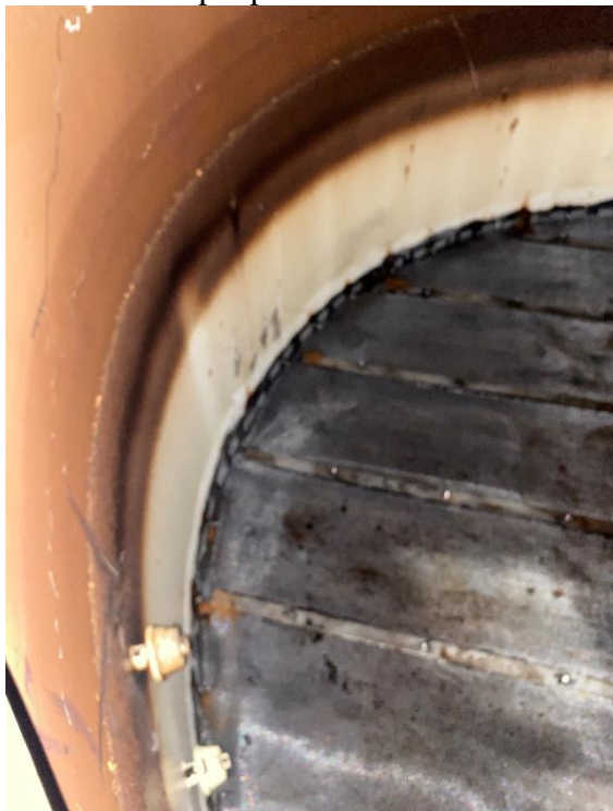
Filter 1 – sample ports - old