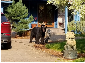
Figure 2: A new neighbor comes to visit